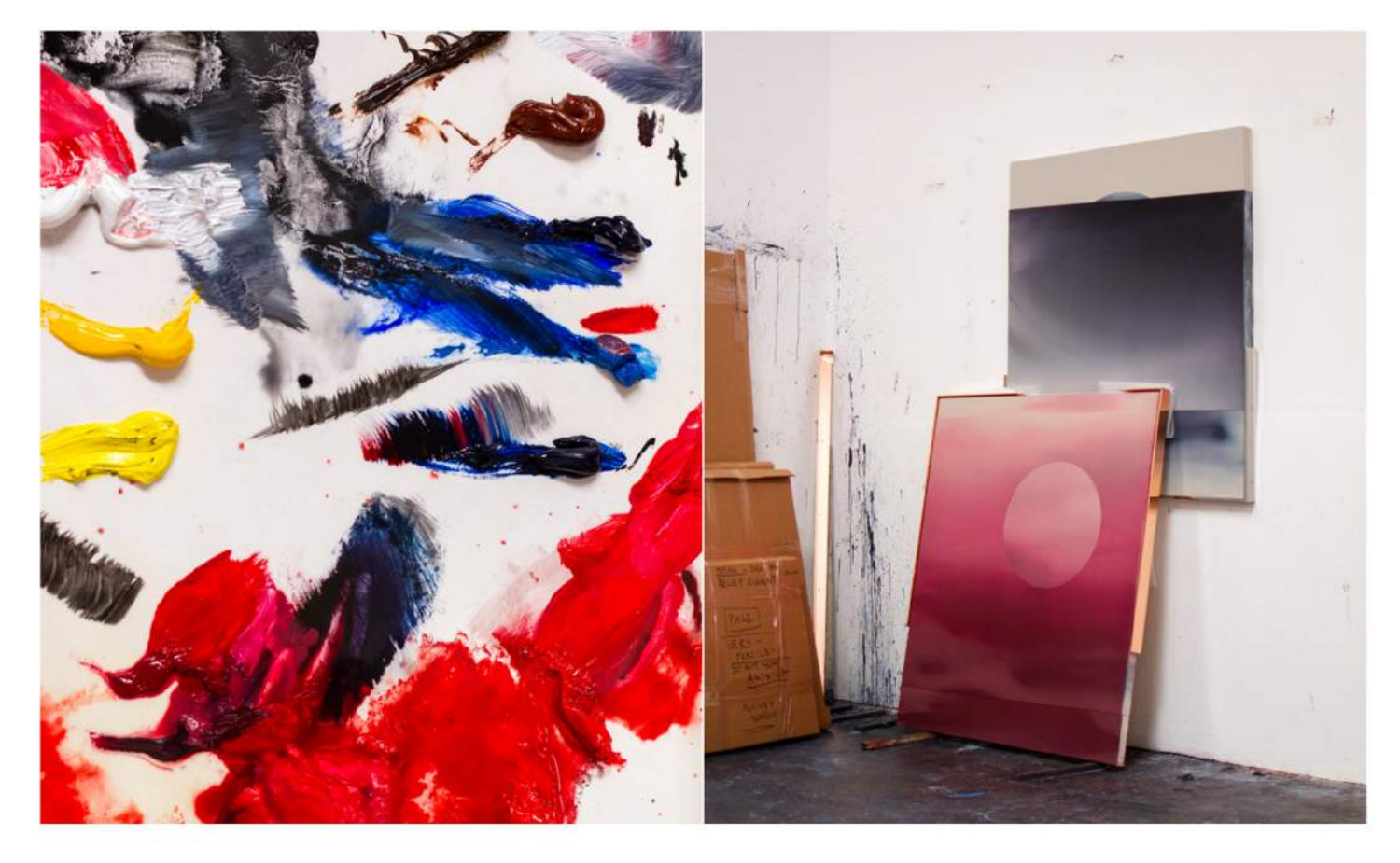
There are moments in your work where the mark making cancels space. Deep black amongst washed out blues and purples. Or diptychs, one monochrome and the other clouded with black and subtle rays of white. I want to jump inside the dark space and be there, except I can't because the pigment has soaked through the canvas, the layers reveal themselves and I am left standing looking at a flat surface.

I am questioning virtual reality and painting. Bertolt Brecht broke the 4th wall in theater, he was always making the audience aware of the structure of the production. If you can see the audience, the audience can see you. The illusion falls apart. The side is where the illusion ends, there was never a two dimensional plane. The rupture happens at the side, when you realize there is an edge and you cannot get too comfortable. The edge is exposure to the working of the painting, technical and/or material. It is fun to include everything so the illusion can be pleasurable, then the criticality comes in and you see the workings of the illusion. The rupture, the drips, the fabric, layering surfaces — there is a mood for both illusion and reality, both are emotional.